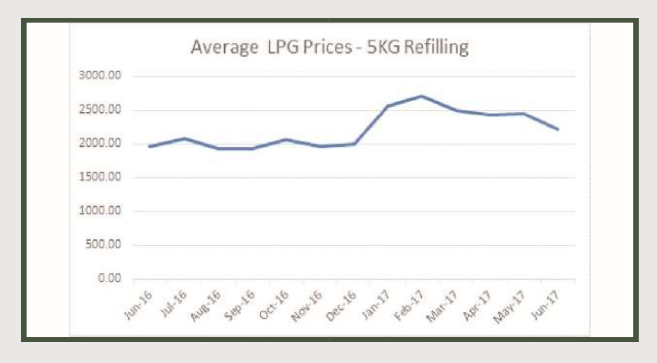
-9.43% month-on-month and 12.91% year-on-year