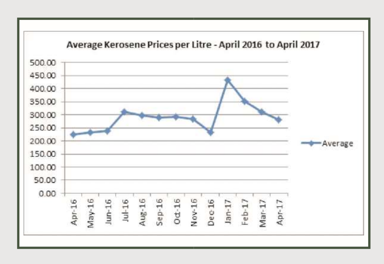
25.77% Year-on-Year and -9.87% Month-on-Month