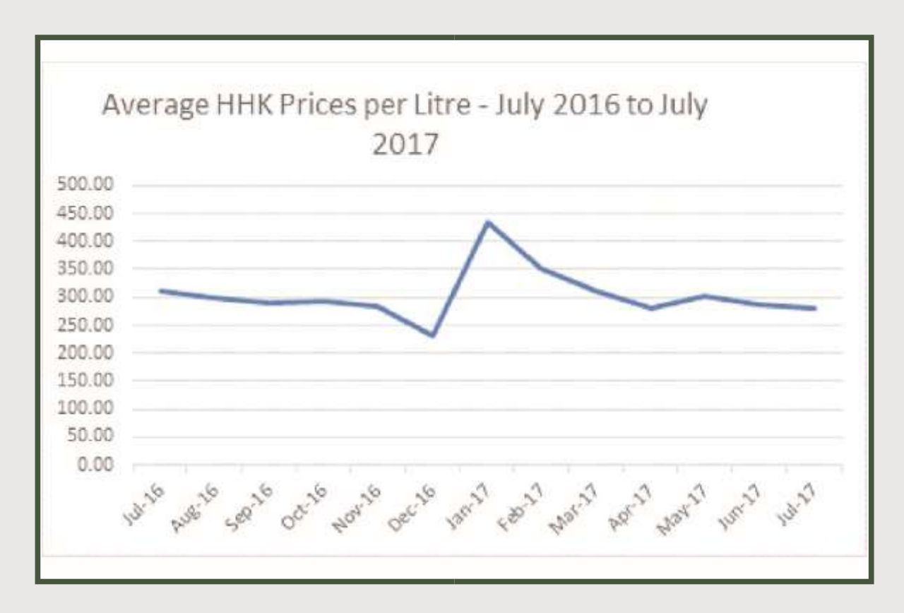
-9.60% Year-on-Year and -2.36% Month-on-Month