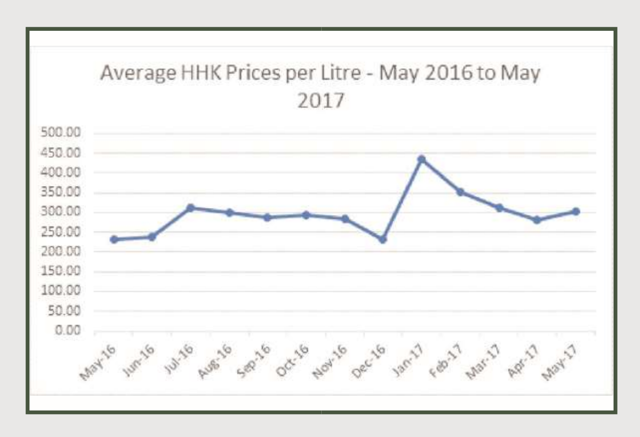
30.49% Year-on-Year and 8.01% Month-on-Month