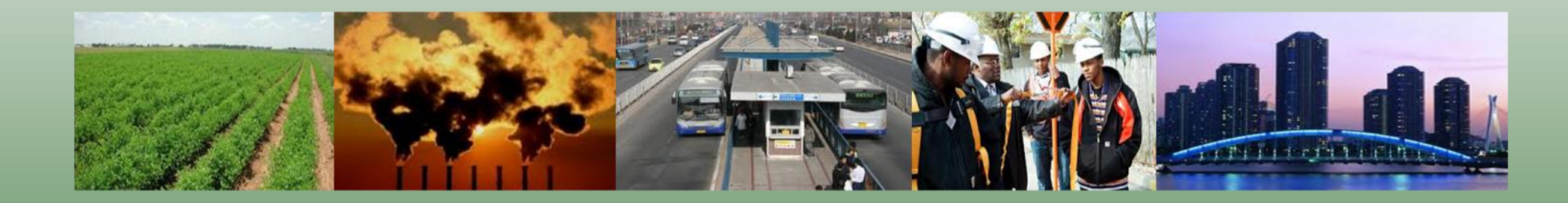
Issue 02: Quarter One, 2015