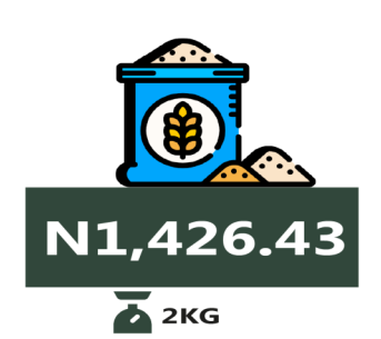
Wheat flour: prepacked (golden penny 2kg)